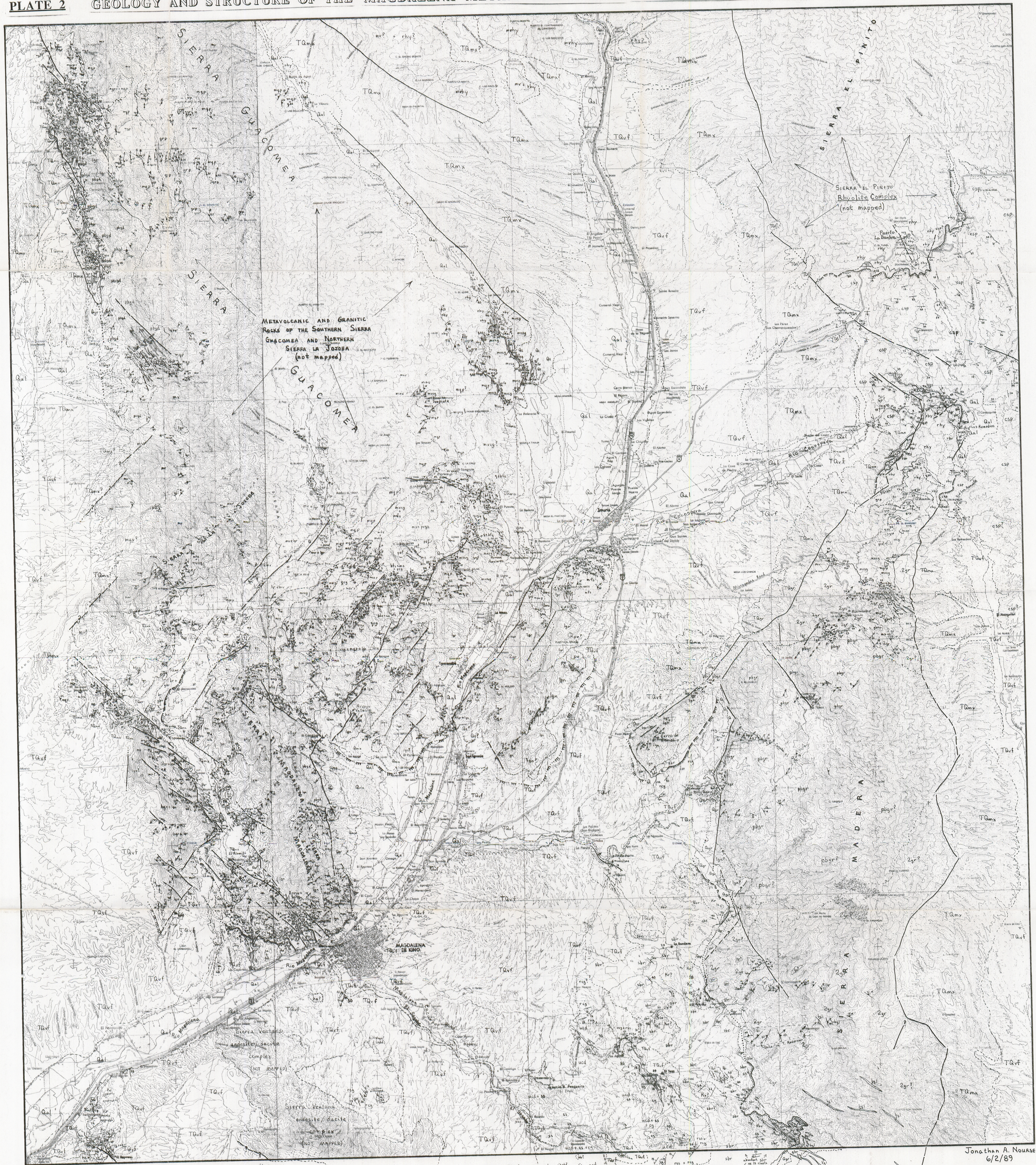
PLATE 2 GEOLOGY AND STRUCTURE OF THE MAGDALENA METAMORPHIC CORE COMPLEX, NORTH CENTRAL SONORA, MEXICO