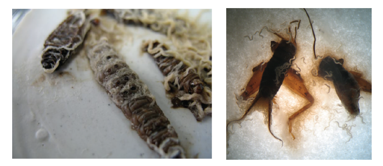
Figure 1.3 | Entomopathogenic nematodes emerging from insects. Pictures showing entomopathogenic nematode infective juveniles emerging from Galleria mellonella waxworm larvae on the left and Acheta domestica crickets on the right

hosts. The infective juvenile is a stress tolerant, non-feeding, bacterial vectoring stage that seeks out insects to infect and kill.