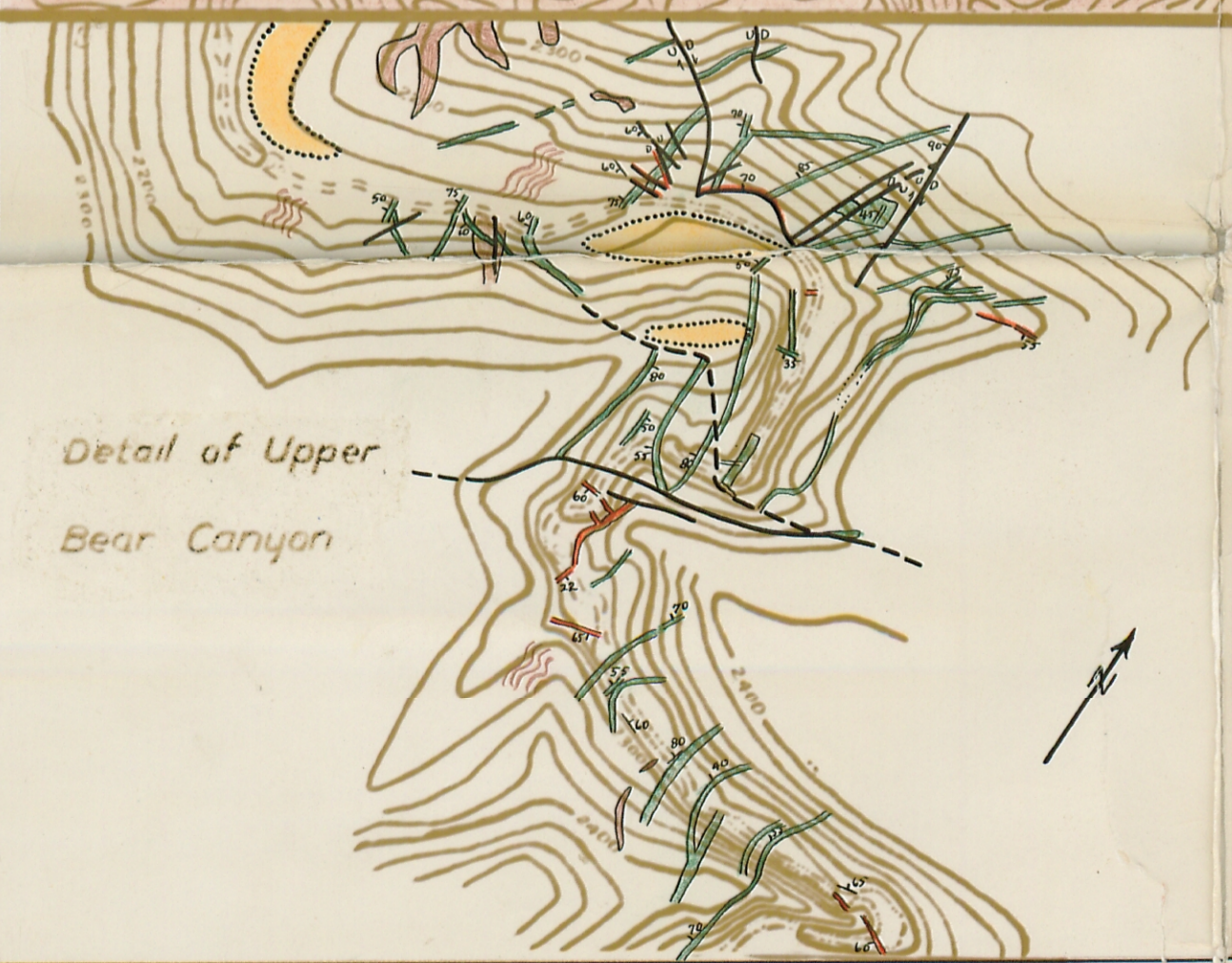
Detail of Upper Bear Canyon