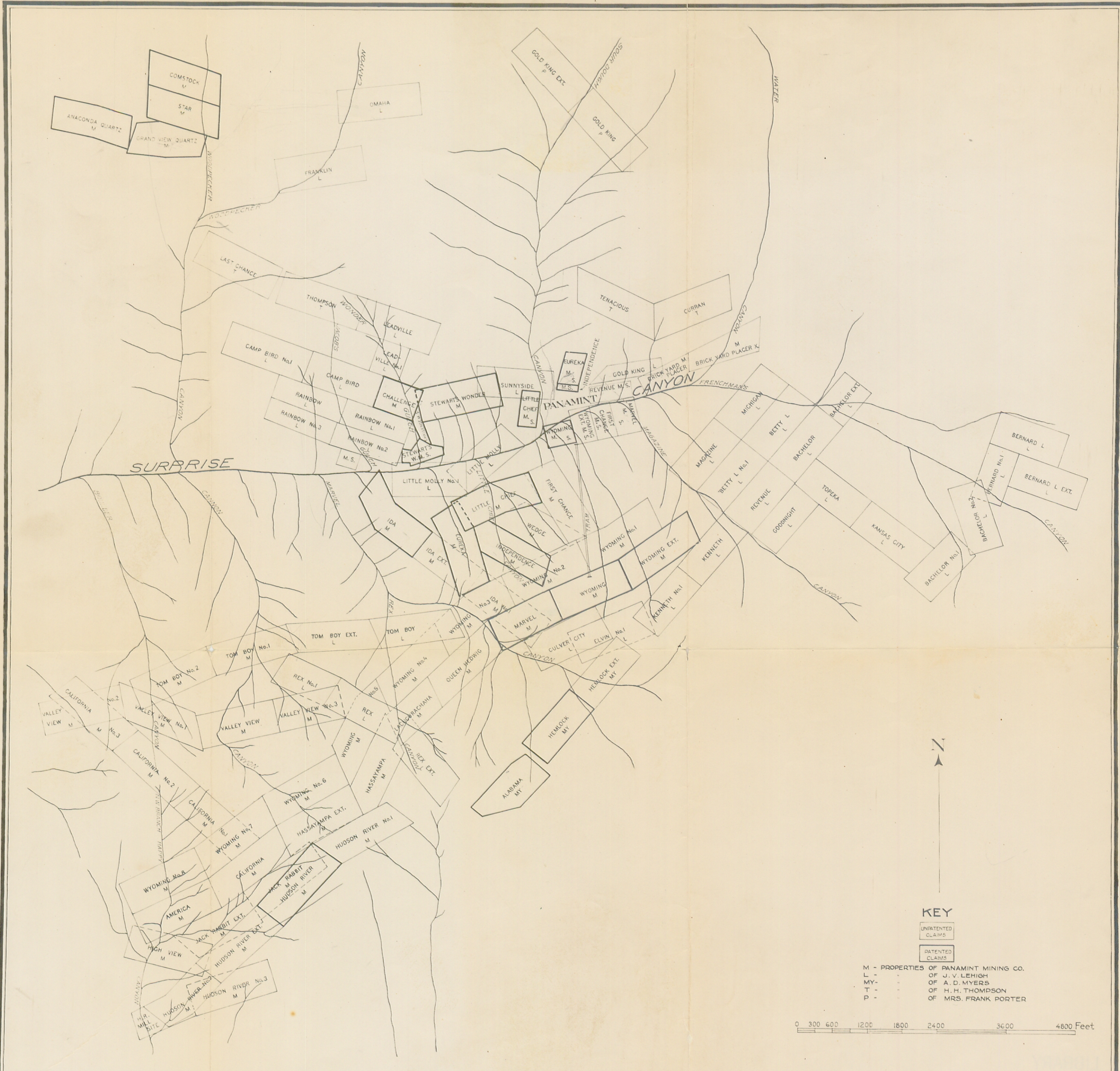
CLAIM MAP OF THE PANAMINT DISTRICT, INYO COUNTY, CALIF.